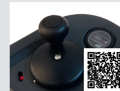
All information at a glance