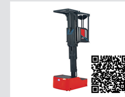
Optimized 1st and 2nd level order picking