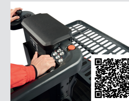
Spacious operator compartment