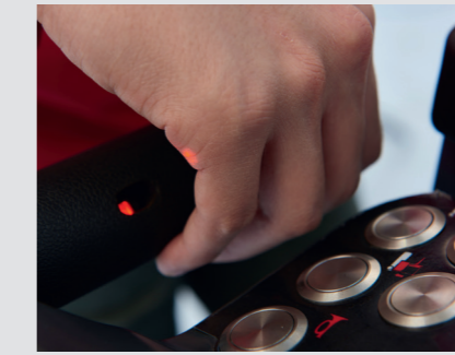
Safety sensor on right handle