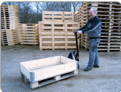
Panther Silent also manages outdoor transport. Metallic chips, small stones and snow do not get stuck to the wheels.