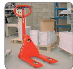
Panther is available with different fork lengths.