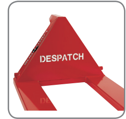
The company name or logo can be cut out in the triangle of the Panther.