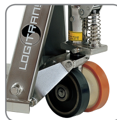
Different wheel types, to suit the needs of the user.