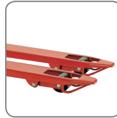
The hoop skates on the forks ensure an easy fork insertion and withdrawal in/out of pallets.