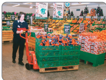
Adjustable fork height - no problems when handling low and worn pallets.