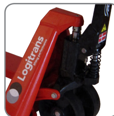
Permanent quick lift.