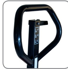
Ergonomic handle ensures the user a relaxed hold. Can be marked with name/department.

Stainless and explosion proof pallet trucks are also available.